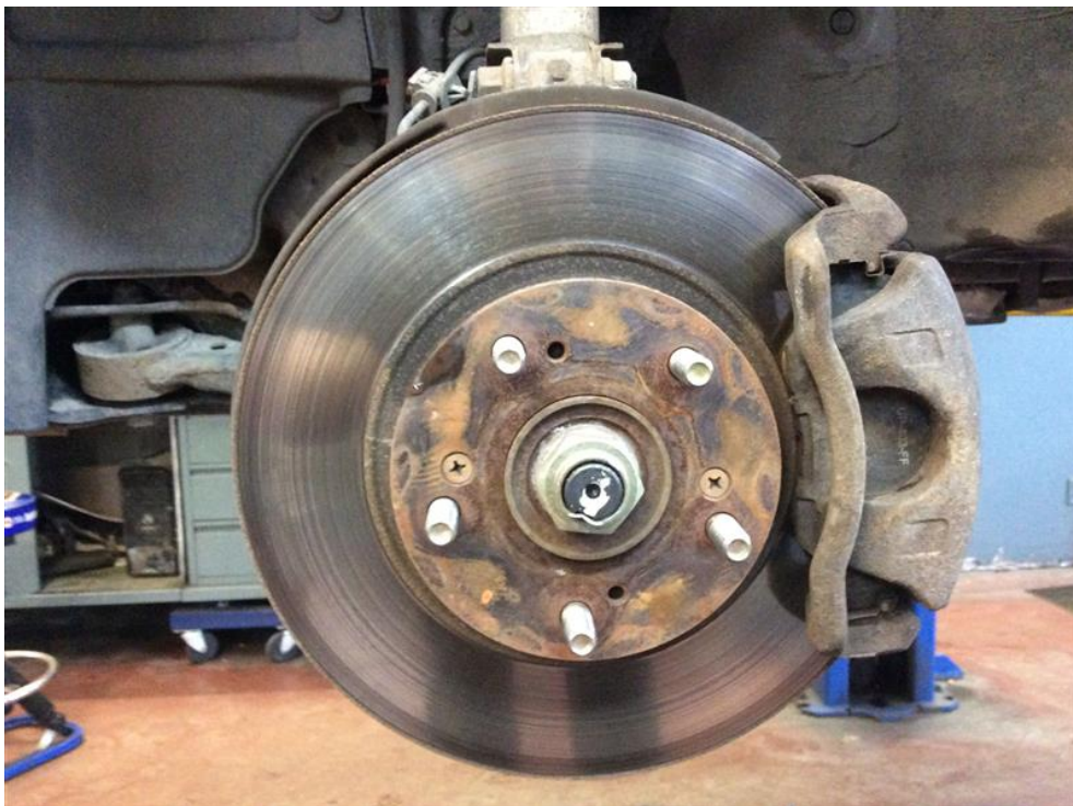
Front brake rotors