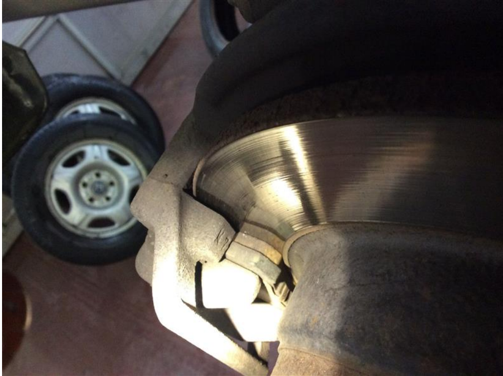
Rear brake pads