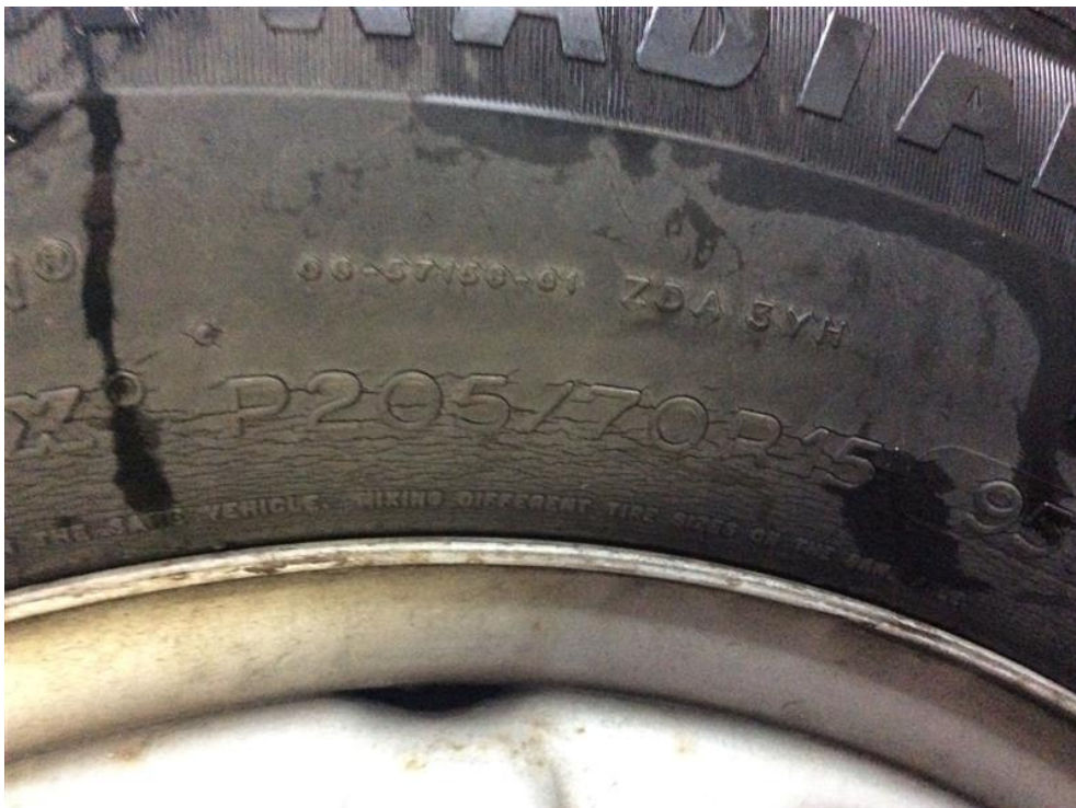
Summer / M&S Tire Condition