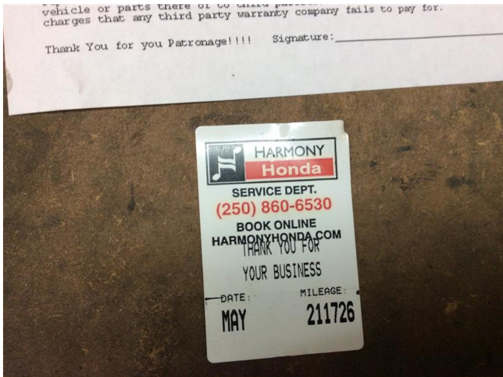
Oil change sticker