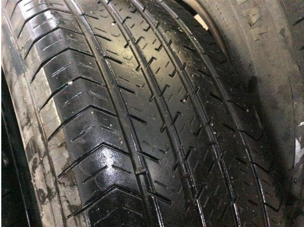
Summer / M&S Tire Condition