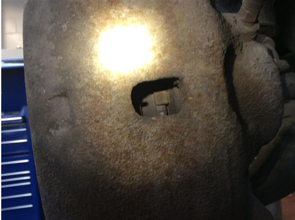
Front brake pads