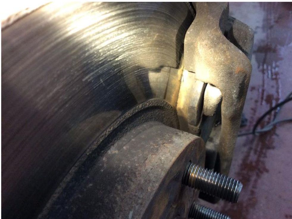
Front brake pads