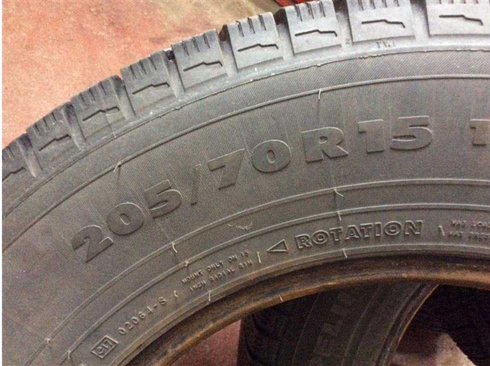
Winter Tire condition