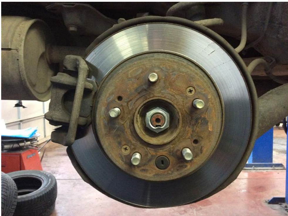
Rear brake rotors