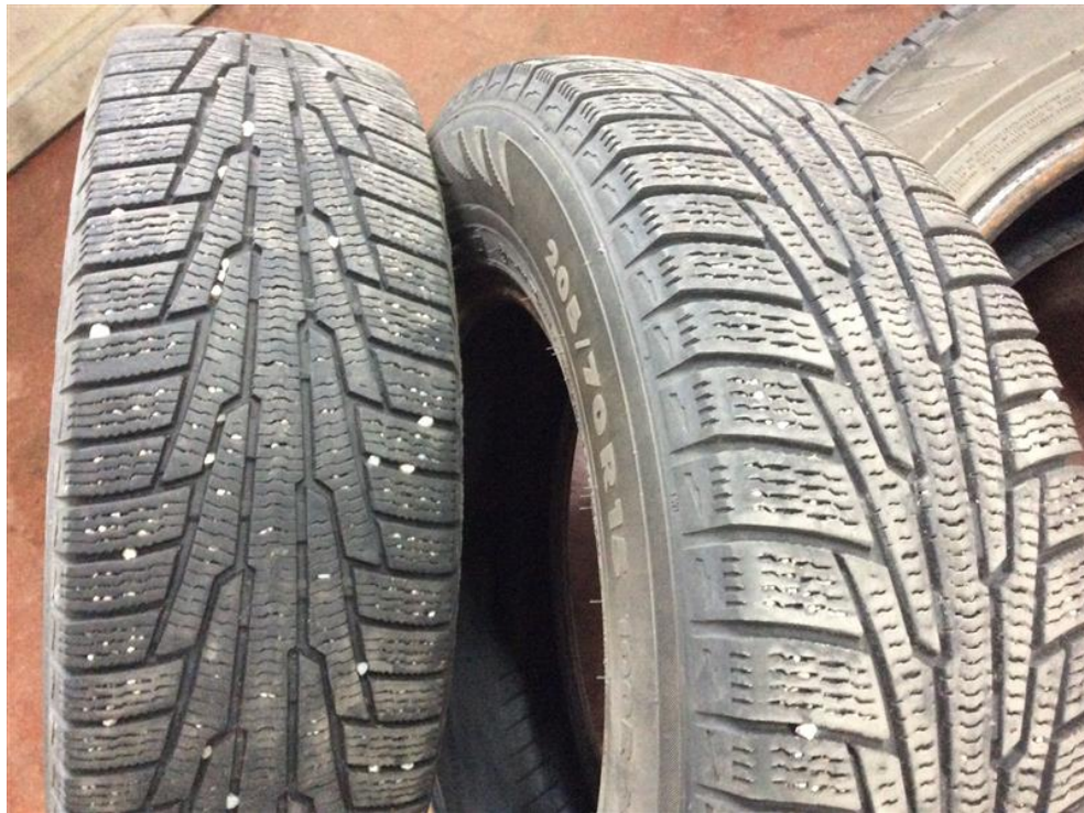
Winter Tire condition