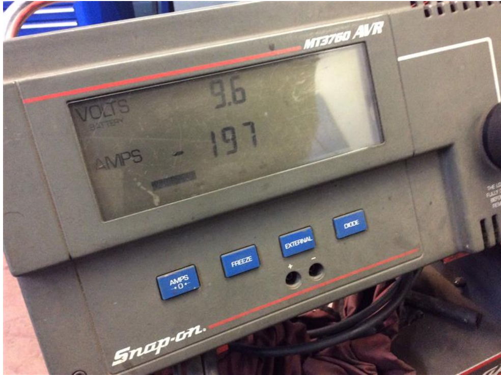
Battery load test