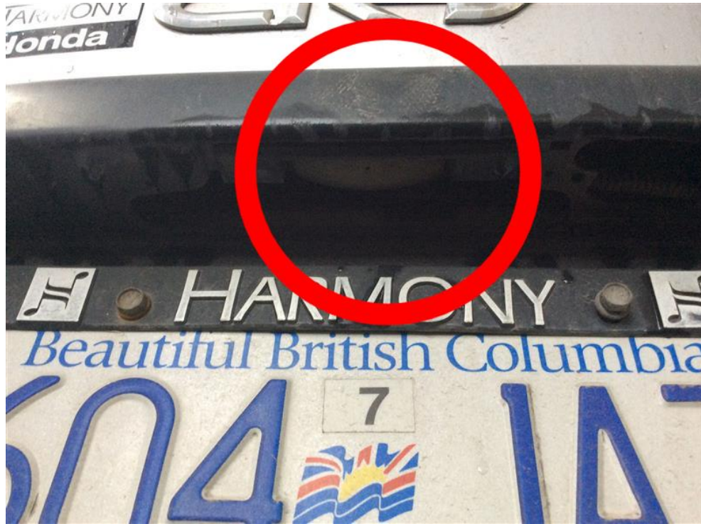
Tail lamp operation