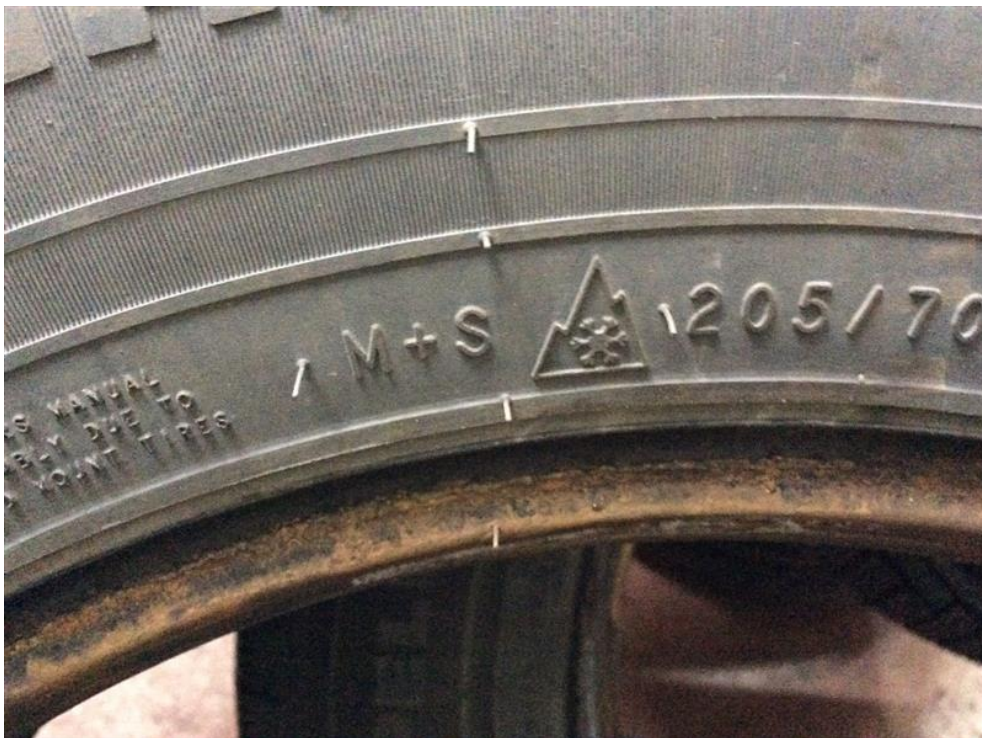
Winter Tire condition