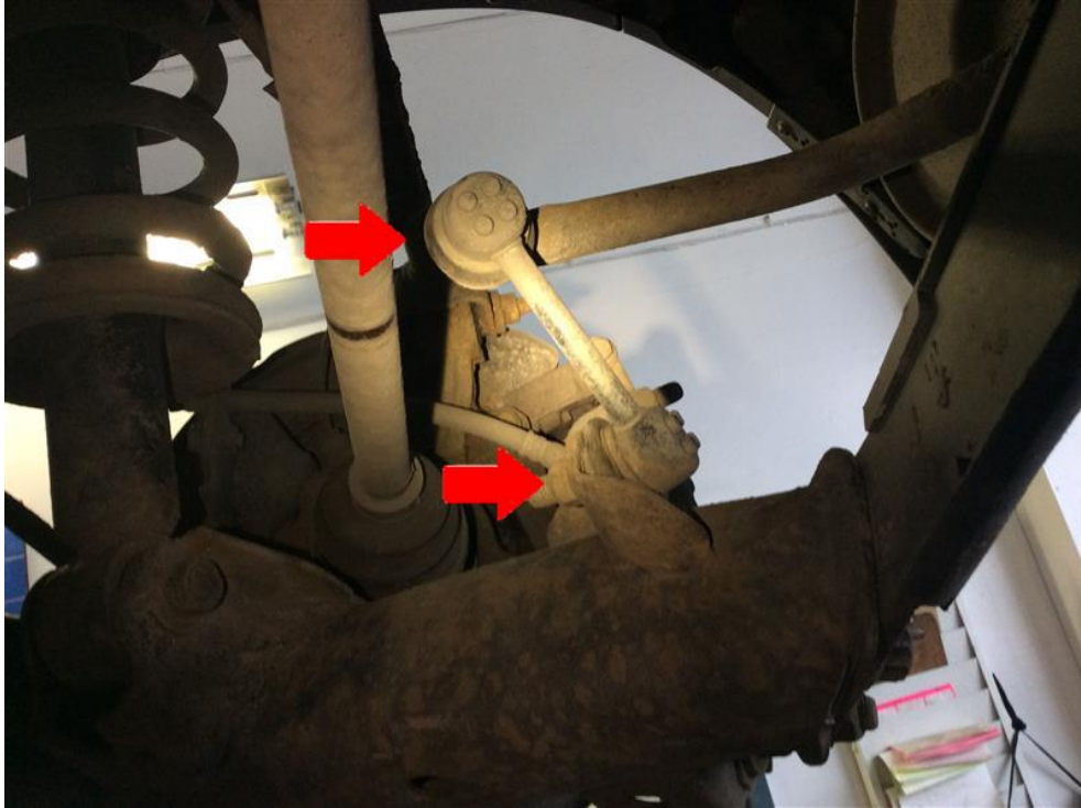
Rear Suspension components